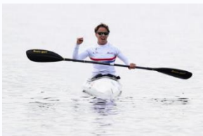
Canoeing is a Paralympic sport.

Look at those amazing smiles! How do you think they feel? I think they feel really proud of themselves and of the achievements they have made in the 12 days of the Paralympics. As well as giving them great Self-esteem it also leads to opportunities to travel and see the world. As they improve it allows them to be more recognisable and become TV personalities. This can then give them a chance to get sponsored with sports clothing and advertising.